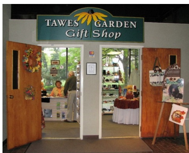
Tawes Garden Gift Shop

14th! The small shop features reasonably priced books, jewelry and gift items for the environmentally minded. The shop is located in the lobby of the Department of Natural Resources headquarters building at 580 Taylor Avenue Annapolis MD 21401.