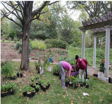
Planting Day, Fall 2021

14th! The small shop features reasonably priced books, jewelry and gift items for the environmentally minded. The shop is located in the lobby of the Department of Natural Resources headquarters building at 580 Taylor Avenue Annapolis MD 21401.